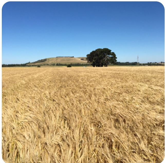
Fandaga nearly ready for harvest in Smeaton Victoria

A useful disease package with a particular focus on its resistance to net form net blotch. Growers who have faced disease issues Fandaga could be a great option in high disease pressure years.